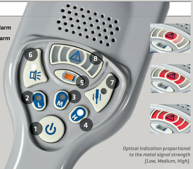
Optical indication proportional to the metal signal strength [Low, Medium, High].