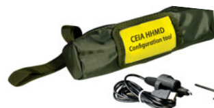
HHMD CONFIGURATION TOOL [# 63537]