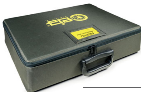
CARRY BAG [# 64082]