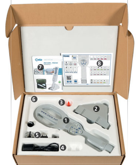
PD240CB [# PD240CB-SET]