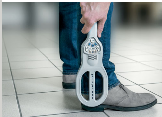
The PD240CB incorporates innovative technical solutions which make it possible to operate much closer to floors with steel reinforcement bars than was previously possible with conventional hand-held detectors. All this without any reduction in sensitivity.