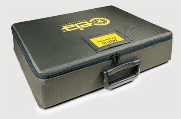
The carry bag does not include parts inside